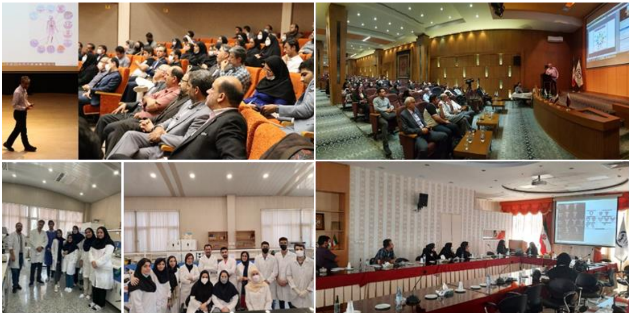
Pre-congress workshops and training courses besides the 1 st International WANA Congress.