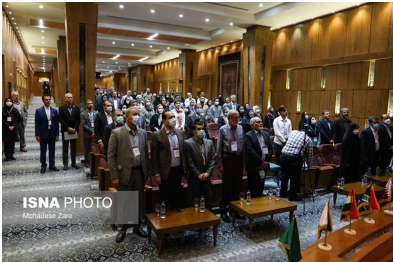
Opening ceremony of the 1 st International WANA Congress.