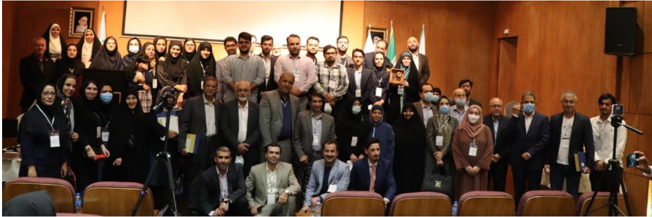
The memorial picture at the closing ceremony.

By the end of all scientific programs on the second day of the congress, there was the closing ceremony launching the WANA Scientific Network declaration ceremony. The Membership Cards of the WANA Scientific Network were allocated among invited speakers and participants during the closing ceremony. In addition, all national and international invited speakers were appreciated for receiving their certificates and symbols of the WANA Congress and visiting the biggest infertility hospital in Mashhad, Razavi Hospital. Finally, a memorable picture was taken.