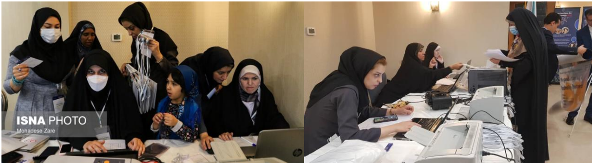
Executive committee of the 1 st International WANA Congress.

Lastly, we would like to state special thanks to our colleagues whose presence was of great support in launching this round of congress and also appreciate Royan Board Members who have played key roles throughout all procedures.