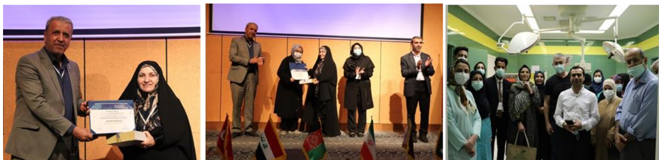
Acknowledgment of the invited speakers and scientific chairpersons during visiting the Razavi Hospital at the 1st WANA International Congress.